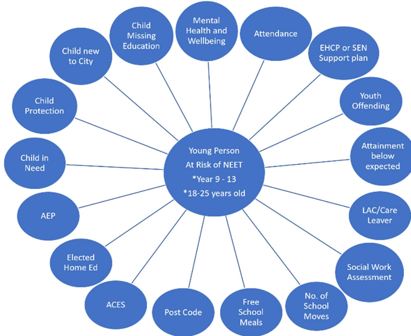
Diagram 1 - Risk factors that increase the Young people's likelihood of becoming NEET